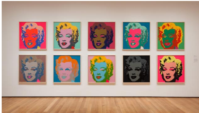
Andy Warhol. Marilyn Monroe . 1967. Portfolio of 10 screen prints. MoMA.