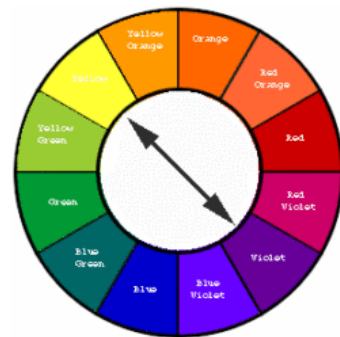
Color wheel showing complementary colors (with high contrast).