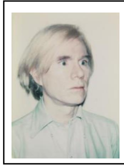
Self-Portrait in Blue Shirt, 1977-8 ARTIST ROOMS Tate and National Galleries of Scotland