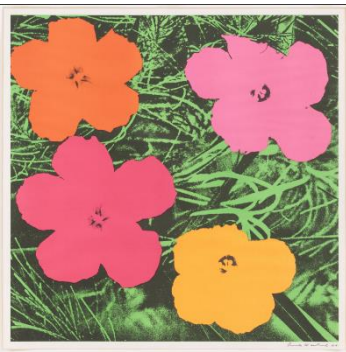
Andy Warhol. Flowers . 1965. MoMA

His favorite art technique was silk-screening, a type of printmaking, because he could make many works of art look the same. He used many different colors that were contrasting. Many of these colors were different than what they were in real life. [He did, however, create many styles of art such as filmmaking, digital artwork, paintings, and sculptures.]